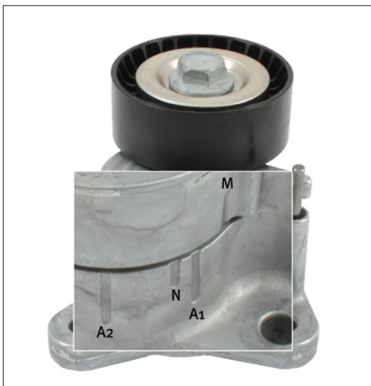
Image 2: Modified markings for the working area of the tensioning arm.

As part of our continuous efforts to improve our products, changes have been made to the tensioning arm 534 0325 10.